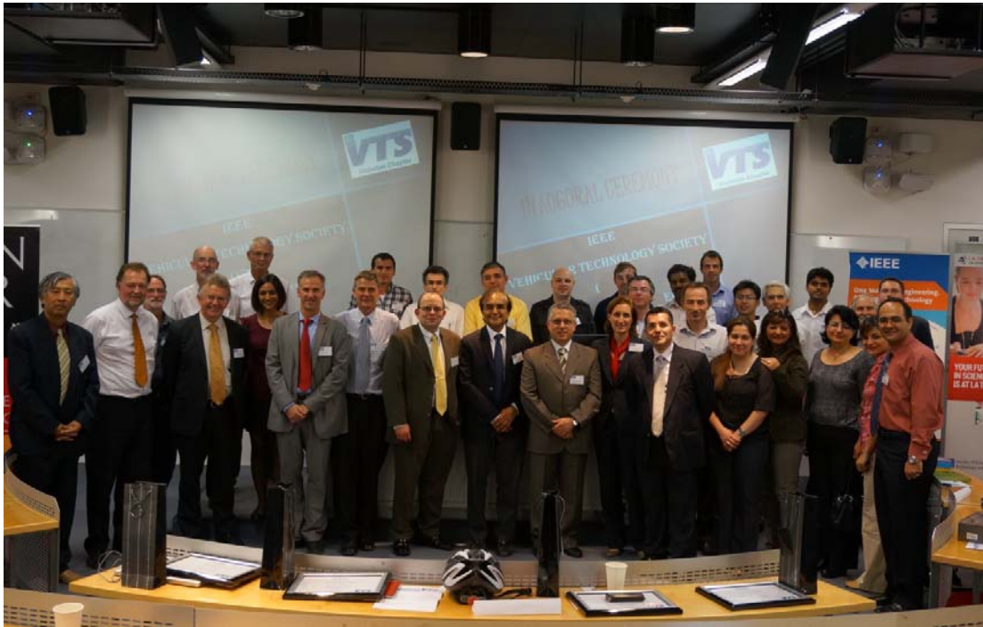
Guests and Guest Speakers and guests at the VTS Chapter Inauguration Ceremony, March 2013.