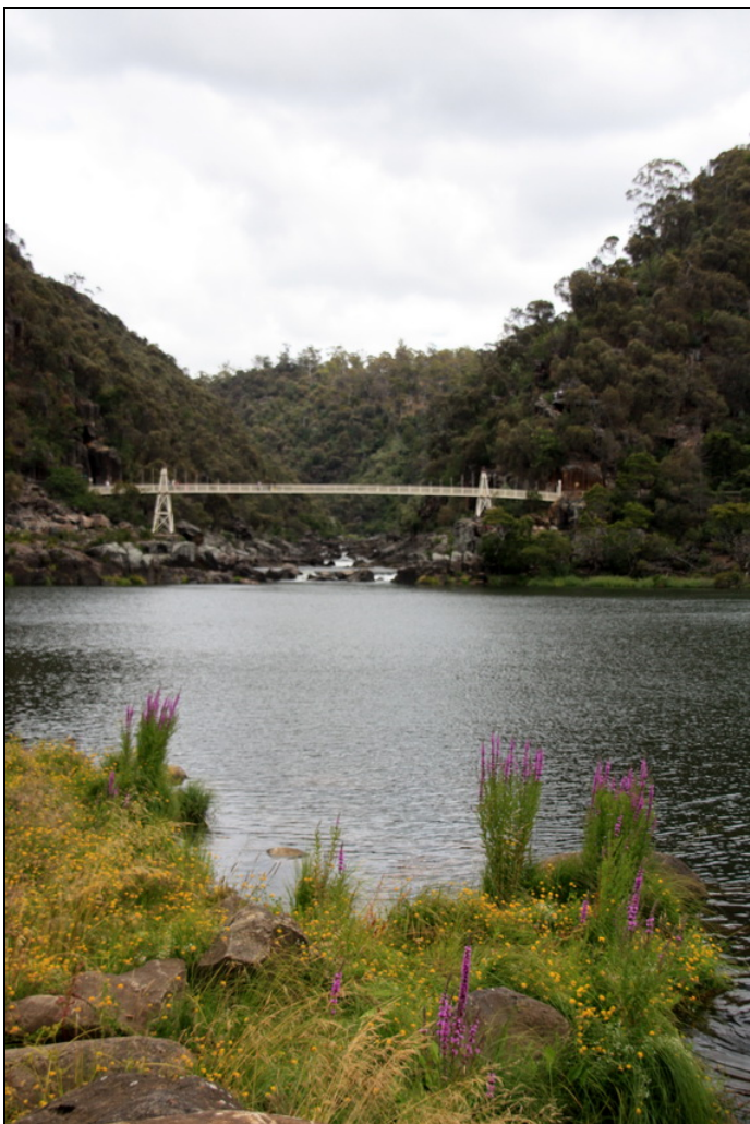
WILDFLOWERS, white-water, and wide span pedestrian bridge, Central Tasmania.

THE TASMANIAN SUB-SECTION was inactive during 2013. In the coming year we hope to proceed further with moves for an IEEE Student Branch at the University of Tasmania. We also plan to extend our industry contacts so as to serve a broader cross section of Tasmanian engineers and IT professionals. All IEEE members resident in Tasmania are invited to join us in this venture. If you are interested in contributing to the renewal of Sub-Section activities, please advise us by email to contact@ieeovic.org .