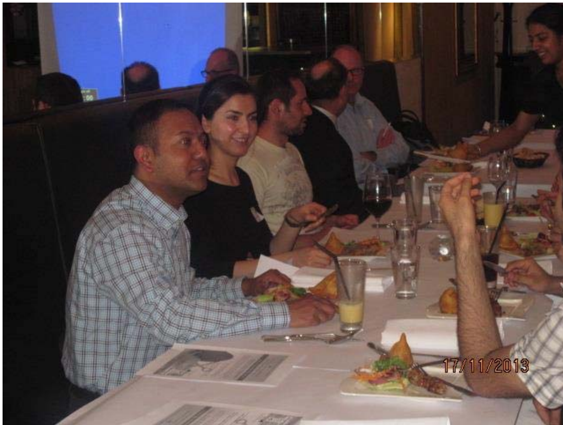
Young Professionals at dinner with guest speakers, November 2013