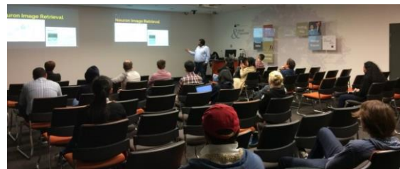
IEEE WIE Event, 17 July.