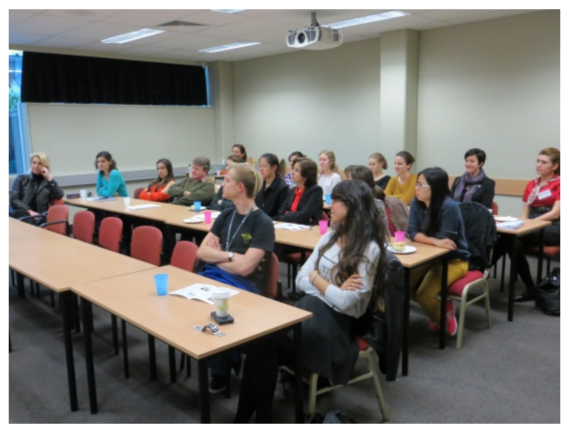
Attendees in Lecture Room