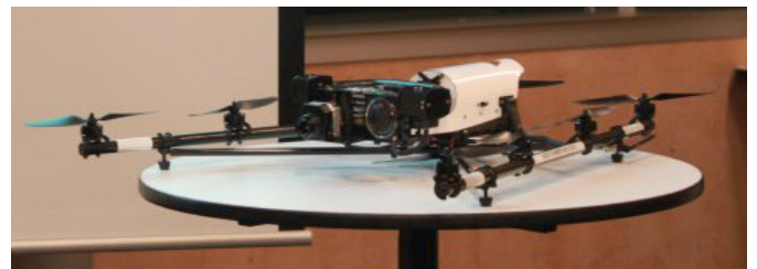
$70,000 battery-operated drone