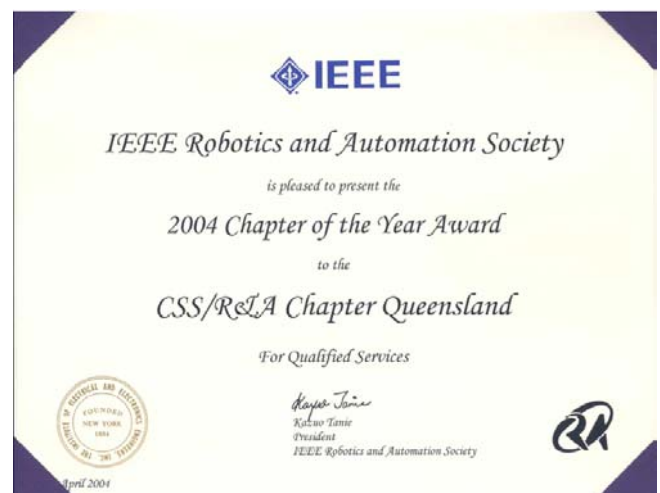
Chapter of the Year certificate awarded to the CSS/R&A joint chapter in April 2004