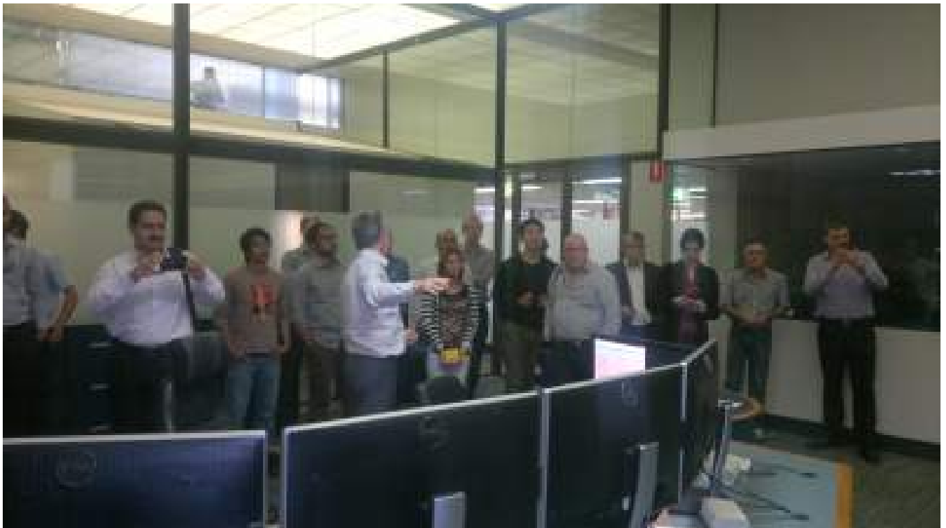
IEEE Queensland Section members visit the AEMO control room