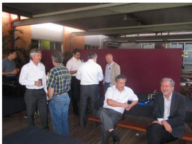
IEEE Queensland Section members enjoying the Senior Members BBQ