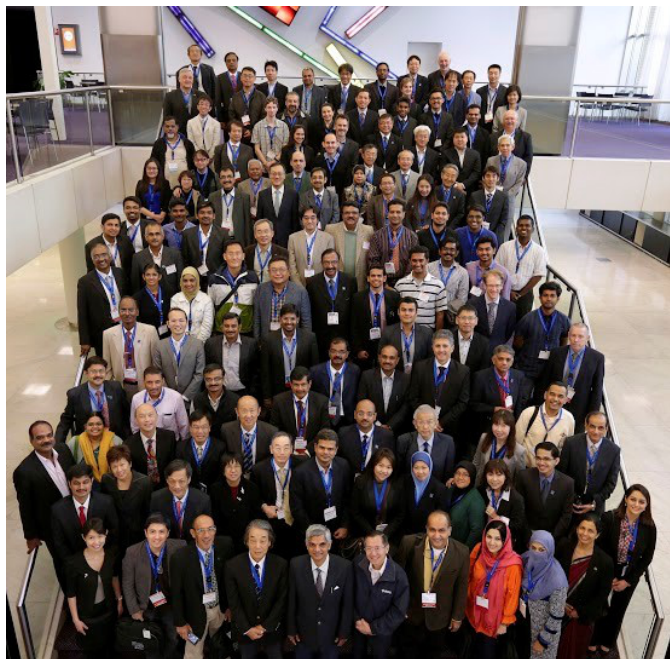
Official delegates of Section Congress (Queensland Section Chair: 4th row, 4th from the left)