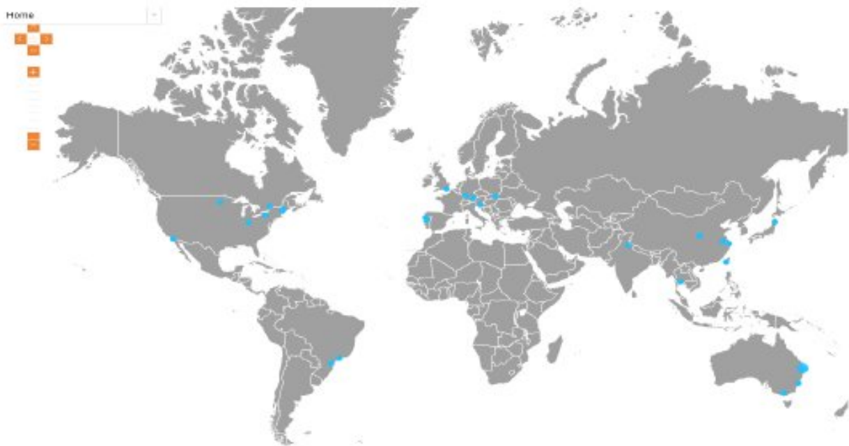
Figure 1: Attendee Geographical Data (Source: Eventbrite)

Thank you to all the organisers, the panellist's and both CIS and WIE who made this event possible.