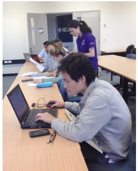
UQ Student Branch volunteers with students at the Student Branch's tutorial session on 17th May.