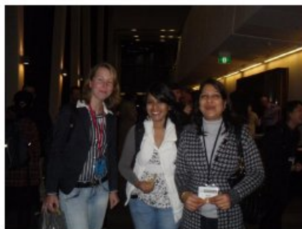
Figure 5: Networking at the reception.