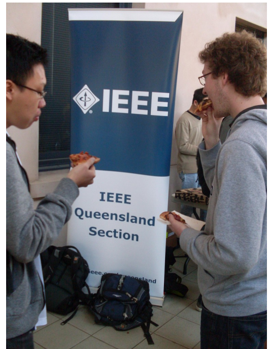
Students enjoy a pizza lunch at the UQ Student Branch function on Friday, 6th August