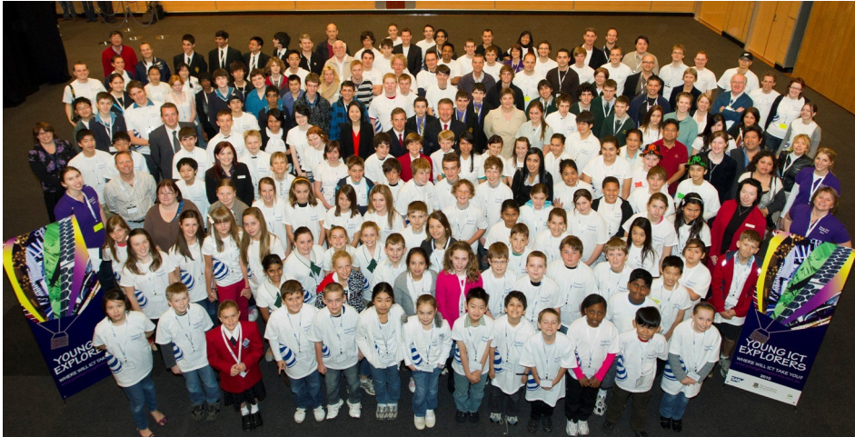
Contestant, Teacher and Volunteer participants in the Young ICT Explorers competition at UQ Centre

On Saturday 7 August, the inaugural Young ICT Explorers event, sponsored by the University of Queensland, NICTA-QRL and SAP Research, was held on the UQ campus. This is a science fair type event, targeted at school children, focussing specifically on the areas of ICT (Information and Communications Technology). There were learners presenting their projects from all over Queensland, including a team from Cairns. The projects were of consistently high quality, which made judging a tough (but rewarding!) task. GOLD is proud to have supported this effort by volunteering 3 judges, and hope to continue support for this function in future!