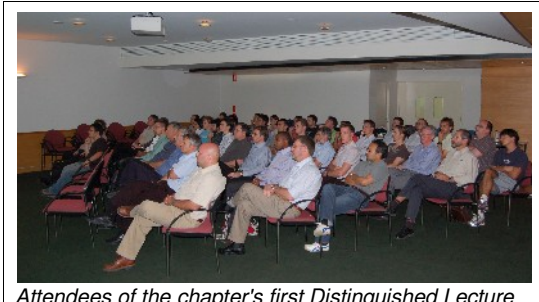
Attendees of the chapter's first Distinguished Lecture