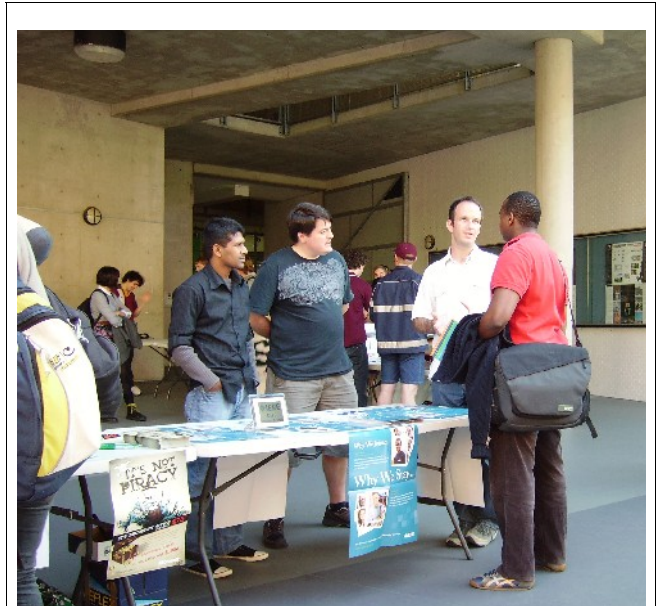
QUT Student Branch table at the Student Showcase and BBQ.