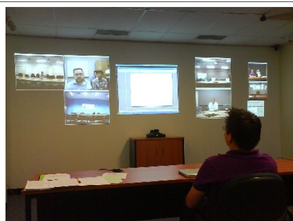
Delegates from CQUniversity, Griffith University, University of Queensland and Queensland University of Technology linked up via Access Grid

Each year the CI Chapter hosts a Postgraduate Student Symposium inviting Queensland-based postgraduate researchers in the field of CI to present their original work to their peers via the Access Grid multi-node teleconferencing system. This year we had a very successful day with postgraduate researchers from CQUni, Griffith, UQ, QUT participating.