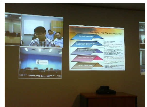
A delegate presenting, the slides visible to all nodes of the Access Grid