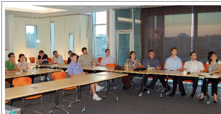
Some of the attendees of the control theory seminar