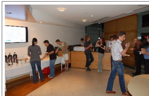
Half-time refreshments provided by GOLD