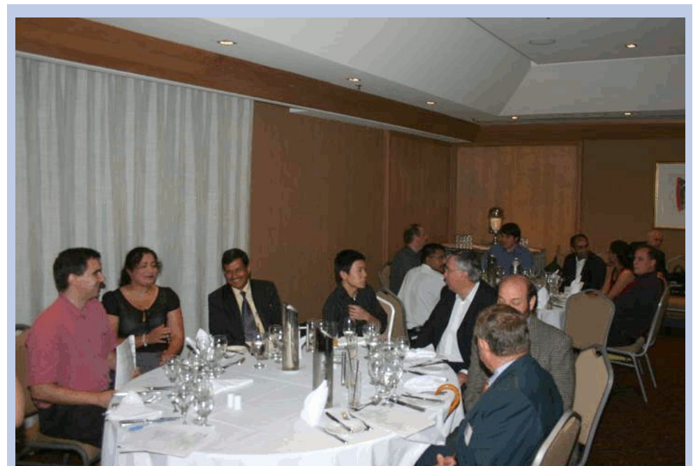
Some of the AGM and Dinner Lecture guests in the Concorde Room at the Sofitel, Brisbane