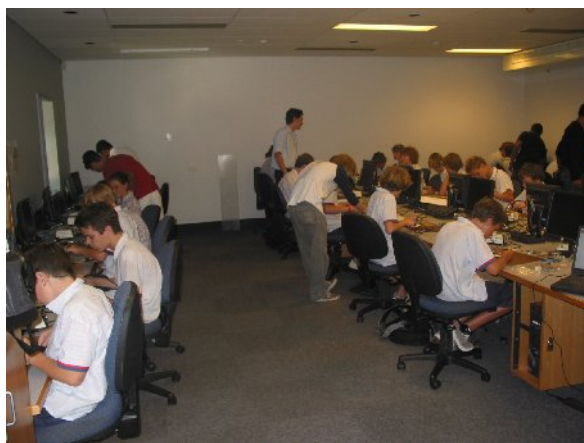
Day 2 Workshop activity

On the 7 th and 8 th of December students (potential future IEEE members) were introduced to the world of robotics by none other than the President of the International Robot Olympiad Committee himself. The workshop was hosted at Griffith University and provided the students with lecture style presentations and hands on workshop activities with robotics.