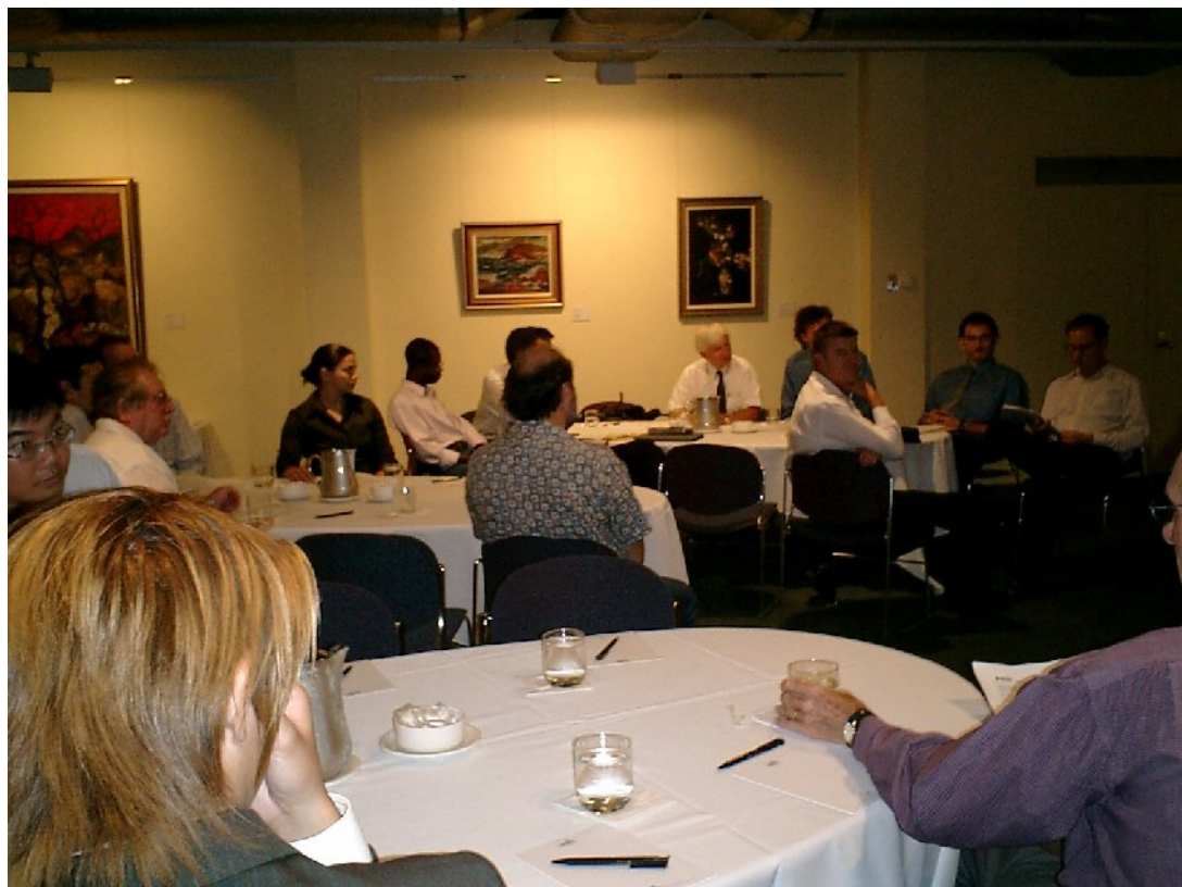
Excellent AGM attendance in the Lady Thiess Room, Customs House.