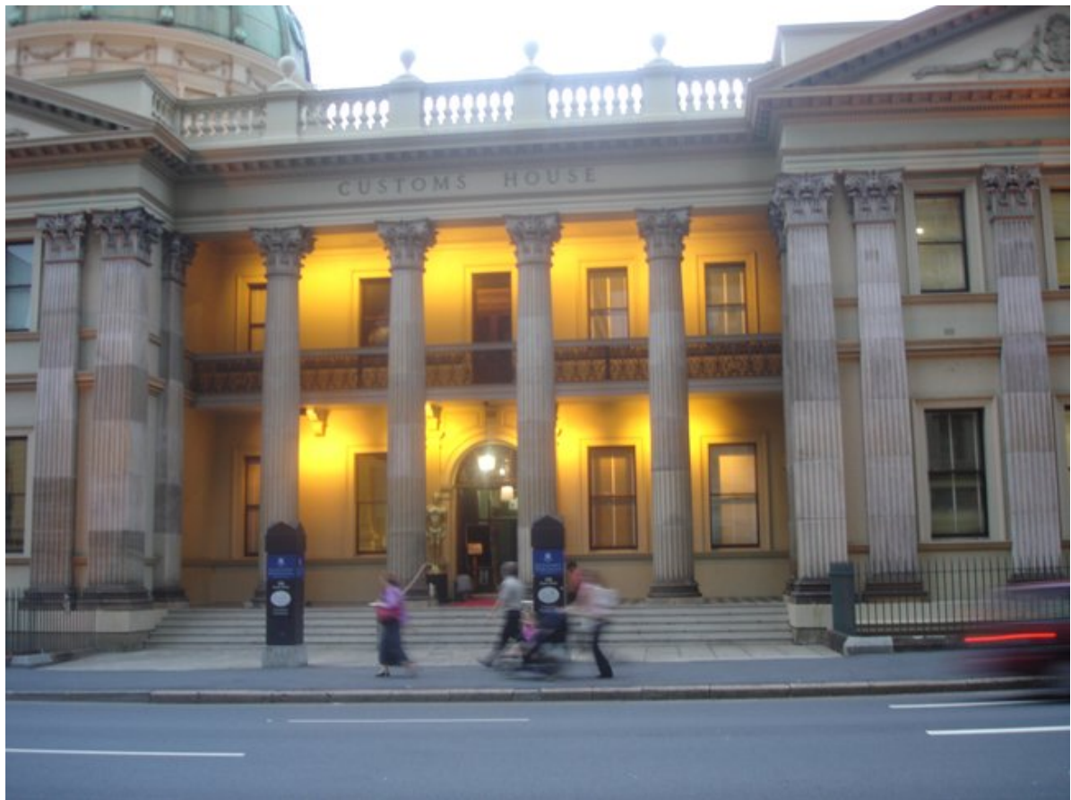
That icon of Brisbane, Customs House, our venue for the AGM and dinner.