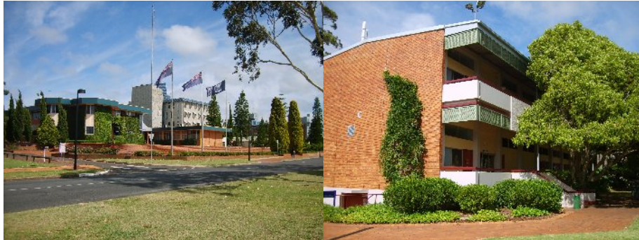
The University of Southern Queensland (USQ) hosted the 13 th annual M2VIP Conference

The CSS/R&A chapter provided technical co-sponsorship for the 13 th annual Conference on Mechatronics and Machine Vision held in Toowoomba from the 5 th to the 7 th of December.