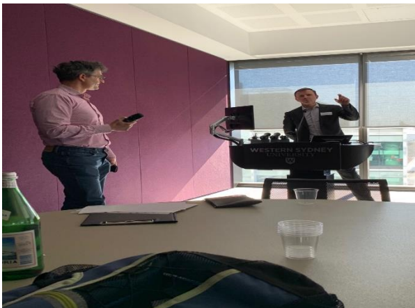
Annual workshop 2019