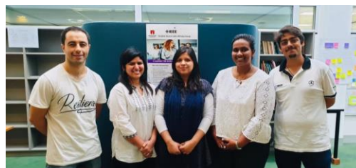
IEEE MQ WIE Executive Committee Members - 2019