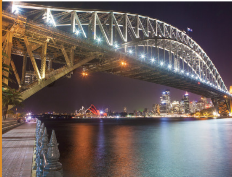
Sydney Harbour Bridge, with the Opera House in the background. ICPADM 2015 will be held in Sydney, July 19–22.