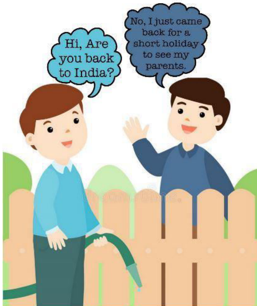
Figure below shows the conversation between a school kid and a professional with overseas job.

reason. Also, only those students who had analytical/mathematical mindsets during high school days opted for engineering education. Whereas in India, a student who may not have had any involvement in scientific or engineering projects may simply opt for engineering college just for the sake of peer pressure or status symbol. I am not talking about students who do this because of parental pressure, rather I am talking about students who simply want to get an engineering degree because they have seen some friends/relatives or neighbors go abroad and lead a great lifestyle. In other words, they have seen friends who had very little technical inclination during high school, obtain engineering degree and work for popular IT or tech companies. Notwithstanding this trend, it's worthwhile to note that non tech. businesses in rich countries have always been quick to spend good amount of money and resources far higher than non tech. businesses in India. Managers in such non-tech businesses of western countries may be Arts/Humanities graduates but they maybe in-charge of handling complex business processes involving implementation of top-notch software tools like ERP, etc.