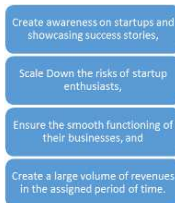
Figure 1 Major Objectives of Incubation Centres

The incubation centres aim at the following four major objectives on the process of promoting entrepreneurs: