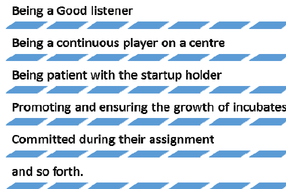
Figure 2 Characteristics of a Good Mentor

The most important characteristics of a good mentor are