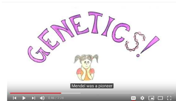
Team iGEM IIT Madras Language Project : Tamil Intro to Synthetic Biology

It has been observed that the public does not have a clear purview of the research and findings in biotechnology, so much so that a basic know-how of genetics is also not common and the brunt of the decisions in public domain falls into the hands of lobbyists for example, GMOs. Hence, they have begun to make and spread content about the basics of biotech in a commoner's language. The content is now available in different languages namely Kannada, Tamil, Telugu, Marathi, Hindi, Bengali, Malayalam, Gujarati, Assamese and English on the YouTube channel for viewing. Each video consists of hand drawn images along with subtitles in English. As this initiative grew more popular, it has attracted the attention of iGEM teams outside of India as well. They have contributed by translating the content of the video into their common language. With the growing amount of collaborations, iGEM-IIT Madras has now released videos in international languages like French, Mandarin, Malay, Spanish, Bosnian, Arabic, Catalan and Chinese.