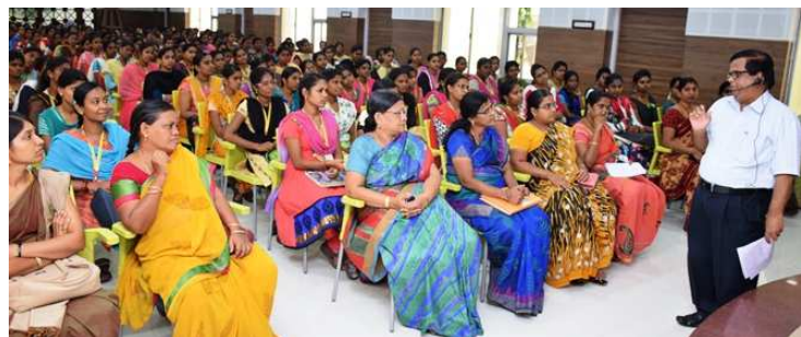
At Srimathi Indira Gandhi College, Trichy on 26th Sep 2018.