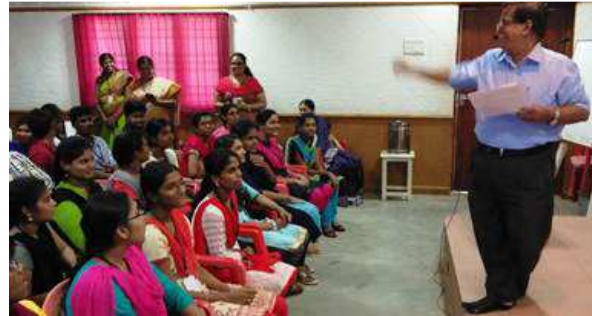
At Saranathan College of Engineering, Trichy on 30 th Aug 2018