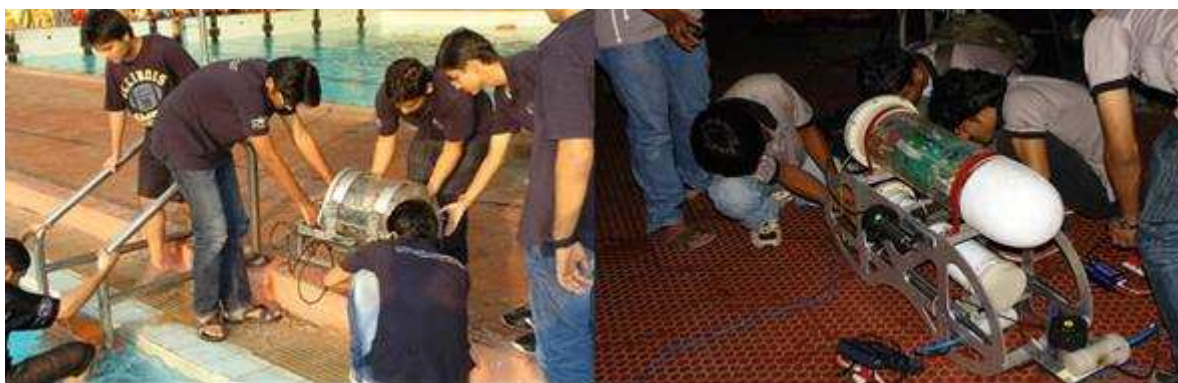
Fig 3 Student teams working during the competition at the swimming pool

Students have to plan well ahead in the initial stages on the time bound deadlines for ordering the components from both National and International market, build, integrate, and test their vehicles. The major factor to be taken into account in the procurement of underwater products is that availability of off the shelf products which might take months' time to receive and could be the cause for missing deadlines. Apart from these, the students have to concentrate on their curricular activities, which is a very important factor to be dealt with win-win attitude in both studies and competition. Fig. 3 shows the student teams working during the competition at the swimming pool.