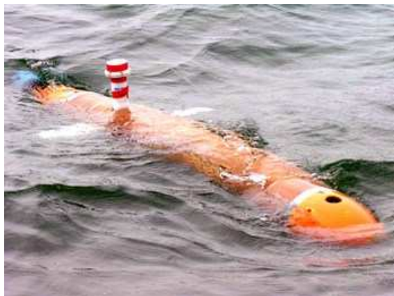
AUV MAYA