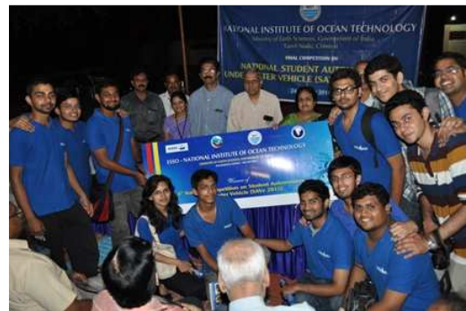
Fig. 4 Winning teams of National AUV competition in the year 2014 and 2015