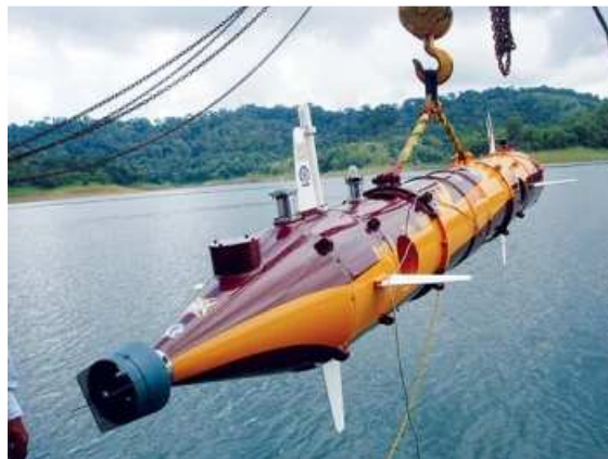
AUV 150