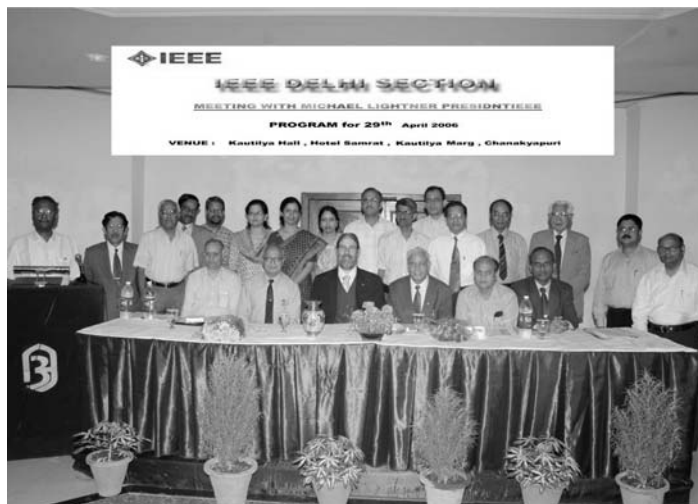
Delhi Section & India Council Exec Com Members with IEEE President