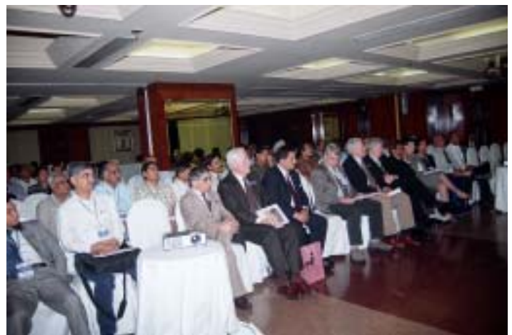
A general view of the part of the audience including PES Exec Com in the first row during Conference inauguration