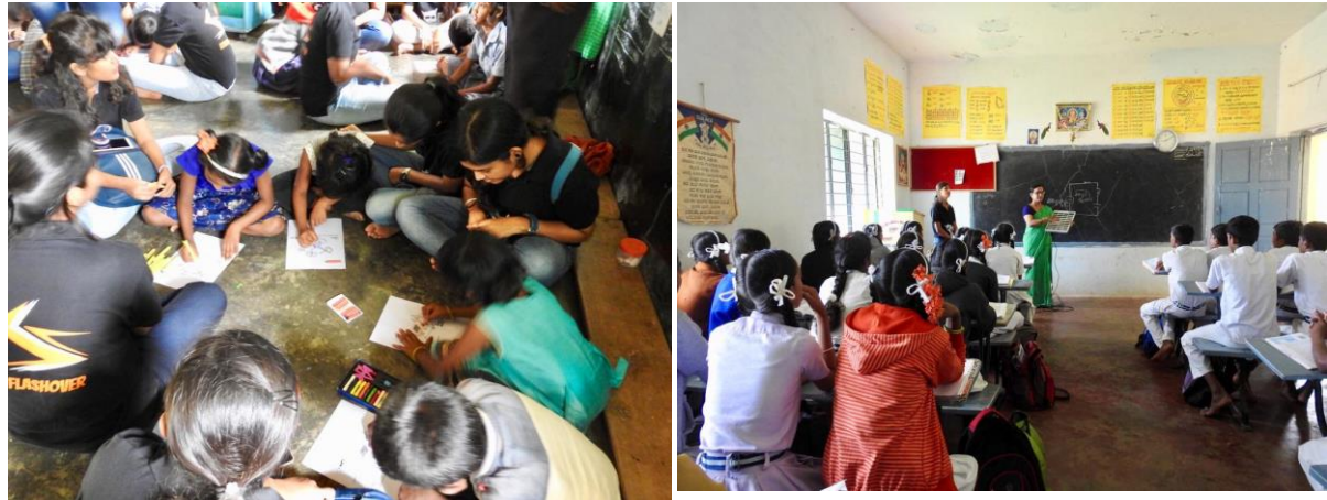
Picture 10: Educational Activity - Awareness Program on Electricity and Renewable Energy

Next, team visited Government Primary School, Hunuganahally, Kunigal Taluk where colouring kits were distributed to the kid's and KID's colouring activity was conducted on Solar Power (house), Wind Power (world) and Solar Power (superhero). The kids were very much enthusiastic to complete the task.