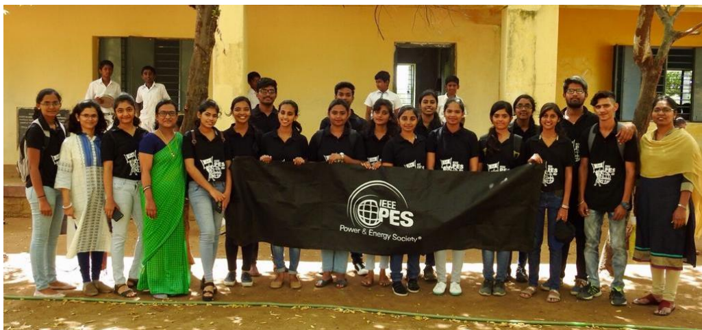
Picture 11: KID's coloring activity was conducted on Wind Power and Solar Power