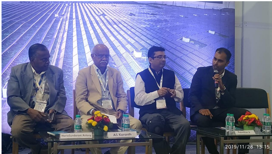
Picture 12: IEEE PE supported panel discussion-1 during inter-solar conference