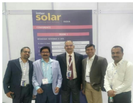
Picture 13: IEEE PE supported panel discussion-2 during inter-solar conference