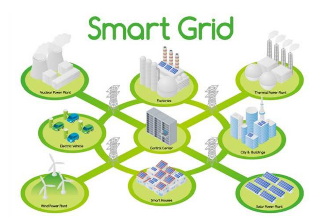
Figure 2: Powers ahead with smart grids

The layout of smart grids is as follows in figure 2.